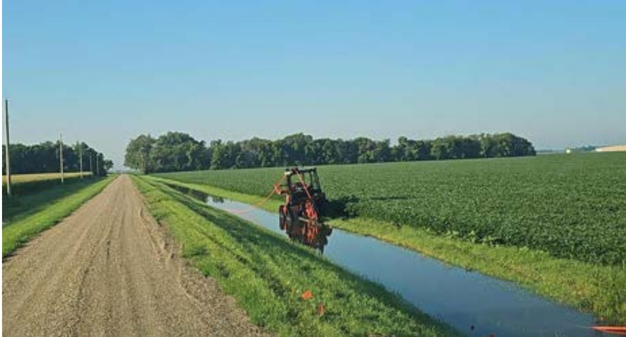
(Above) MLGC rented trencher idle due to water-filled ditches, preventing duct installation near Lynchburg, ND.

Through the CPF program, North Dakota continues to move closer to its goal of bringing high-quality fiber service to every location across the state.